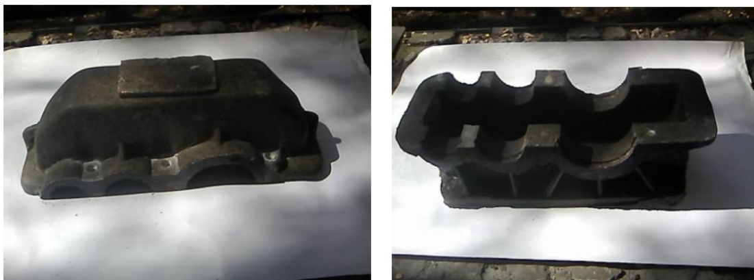
Figure 2 – Finished gear case

According to the results of carried out studies the gear case (Figure 2) and pump casing (Figure 3) were manufactured through casting. Both items passed bed tests and showed good results in operation.