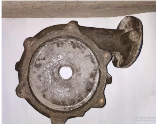
Figure 3 – Finished volute casing

Conclusion. The studies performed made it possible to make the following conclusions.